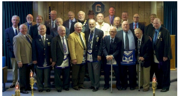
24 Past Masters attended the Spring Past Masters Night on March 27 th .