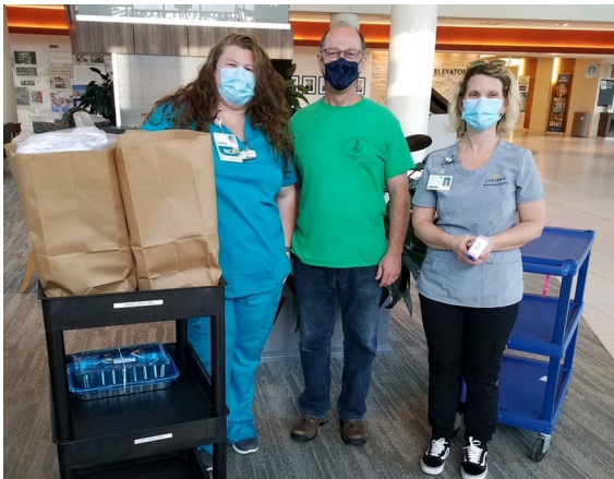
A special Bull Roast delivery to Sentara Leigh ICU nurses. Recognizing all the hard work these front line medical professionals do every day for the community.