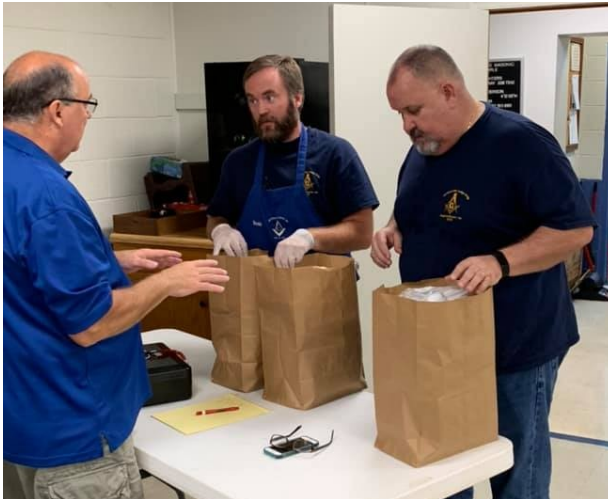
The first Bull Roast deliveries heading out the door.