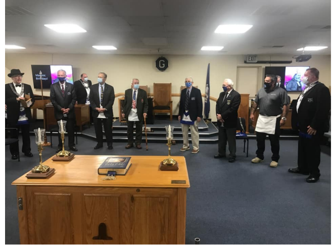
Brothers celebrating their Masonic birthdays at our November Stated meeting. Each was presented with a Masonic coin by the Worshipful Master (left; coin design shown on the front page).