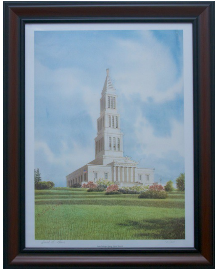
George Washington National Masonic Memorial