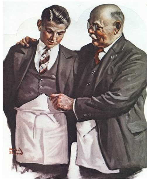
The Proud Father