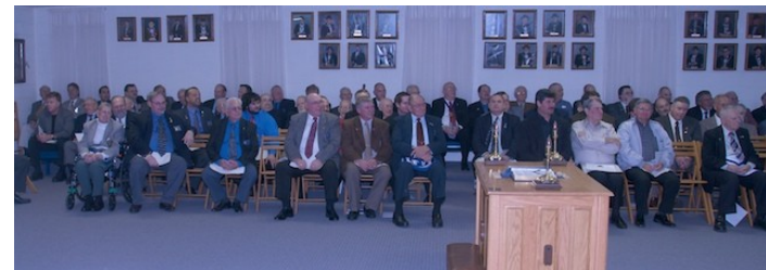
Over 140 Brethren from around the region attended