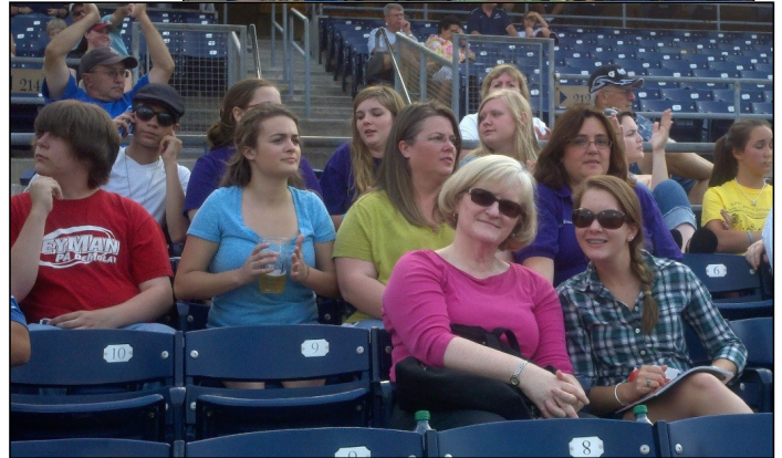
Brethren, friends, family, DeMolay, and Jobies enjoying Kempsville Lodge's "Baseball Night" at Harbor Park on June 19th.

NON PROFIT ORG. U.S. POSTAGE PAID NORFOLK, VA PERMIT NO. 508