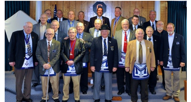
22 Past Masters and Affiliated Past Masters attended the March 29 th Past Masters Night.